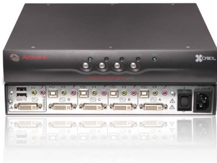
SwitchView SC4 UAD switch gives users convenient USB peripheral support and DVI-I video for resolution up to 1920x1200 @ 60Hz.

An added benefit of the SwitchView SC4 UAD switch is the DVI-I video. The DVI-I video lets government analysts easily view high resolution applications such as detailed mapping or satellite images, which is a critical security asset. The SwitchView SC4 UAD switch with USB support, advanced video and enhanced security is a major advancement for the secure government computing environment.