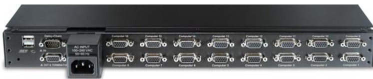
Back view of the integrated LCD rack console.