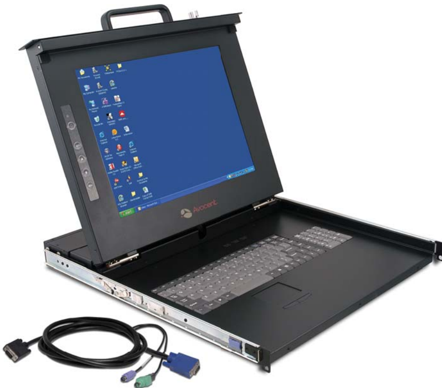
Front view of the LCD console with integrated KVM switch and combo KVM cable that connects to the back of the LCD tray and provides USB or PS/2 cables.